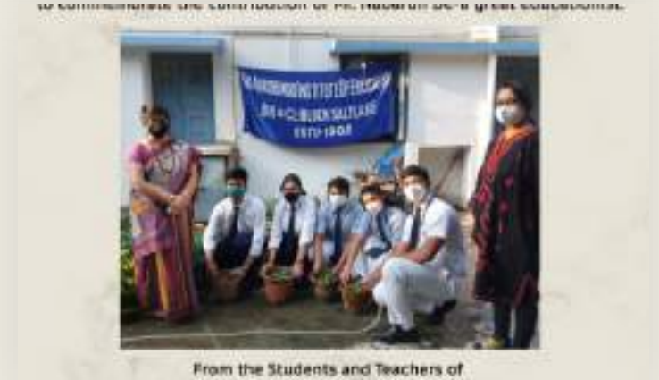
From the Students and Teachers of