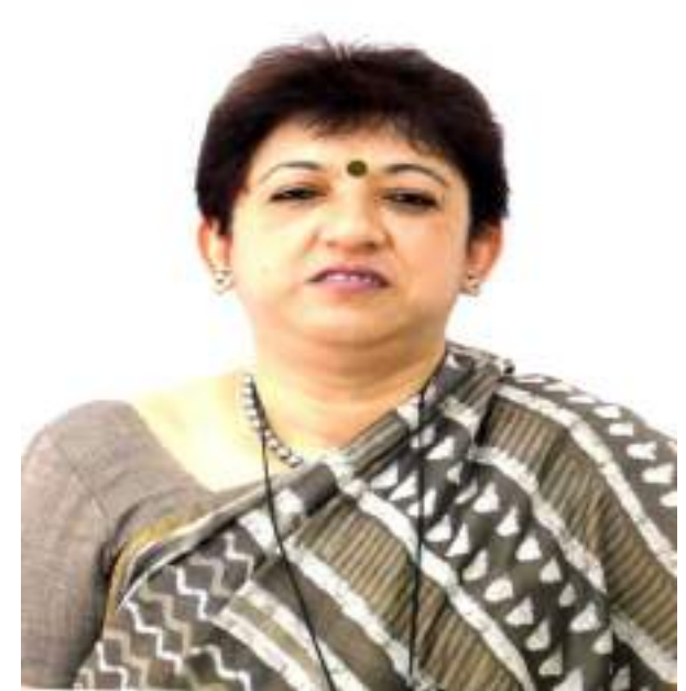
KAZI NAZMUR RAHMAN EL-BETHEL SCHOOL (WB307)